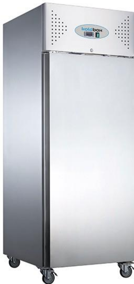
Image shown is a KXF600